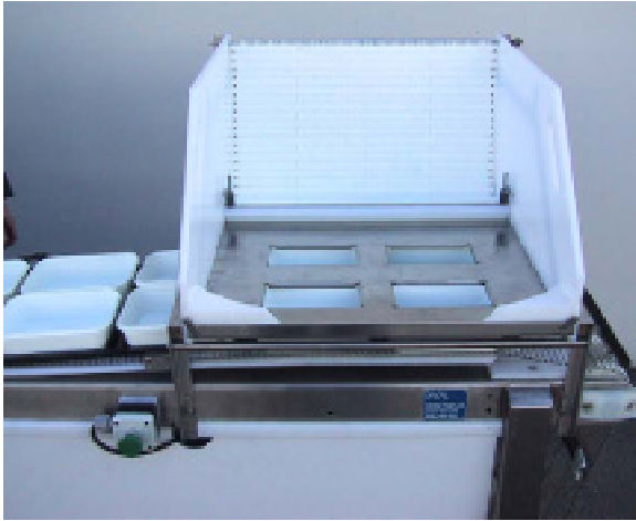
Semi-Automatic Filling Station.

The BENTO IKURA FILLER delivers the accumulated Ikura to the forward Bento boxes, retracts to the second filling station and then retracts to the storage area. A single momentary contact push button recycles the next four Bento boxes.